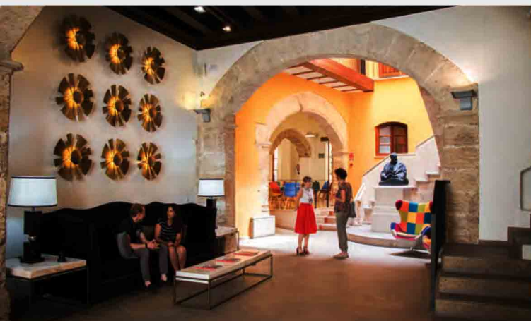
| don Quijote Valencia campus

Specialized Private One-to One classes (example: Business Spanish, Medical Spanish, Legal Spanish, etc.) available for an additional fee of 15%. See page 8.