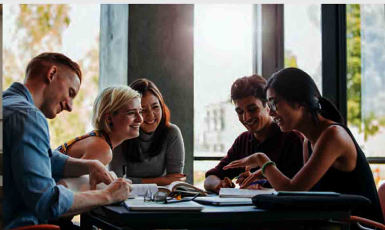
| don Quijote Madrid campus