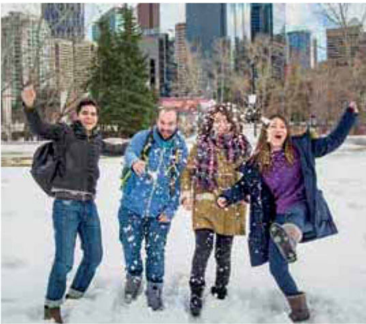
Set against the backdrop of breathtaking natural beauty, Sprachcaffe Calgary is the perfect place to learn English.