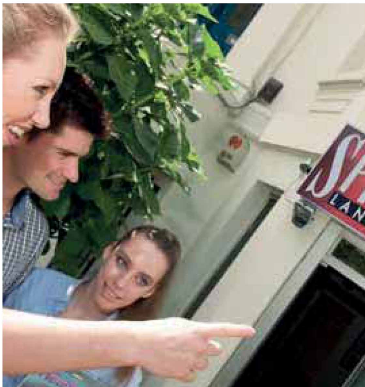
Our British Council accredited centre in London offers enjoyable English courses in one of the most exciting cities in the world. The Sprachcaffe Language School is located in Ealing, a blossoming neighbourhood in West London.

London combines the excitement of fashion and cultures. Learn English in the trendy British capital.