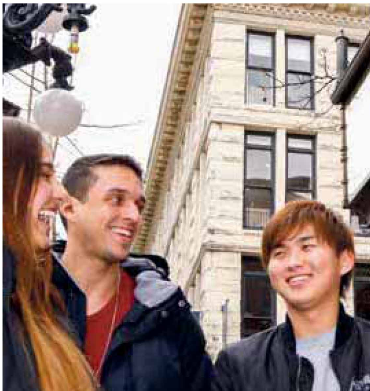
Quality of life in Vancouver is considered to be among the best in the world. Everything here plays its part: The surrounding nature is sublime, not to mention the culture and entertainment programmes.

An enjoyable paradise with a multitude of leisure activities for everyone, be it shopping, nightlife or sports.