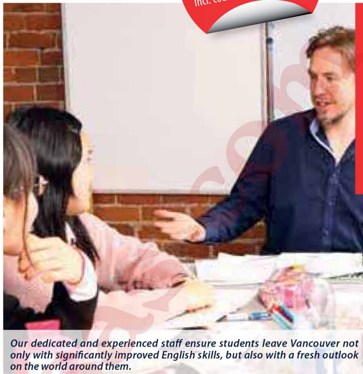
Our dedicated and experienced staff ensure students leave Vancouver not only with significantly improved English skills, but also with a fresh outlook on the world around them.