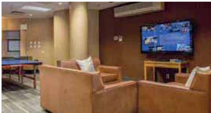
The attractive location is complemented by the school's modern facilities, including a common room, computers and WiFi.